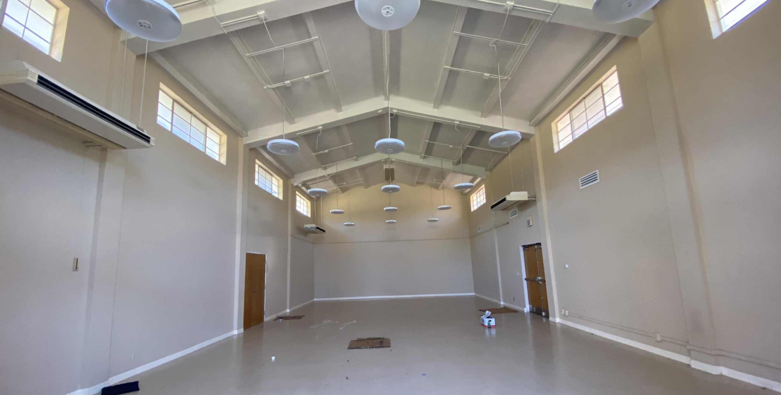
Wisdom Hall Chapel